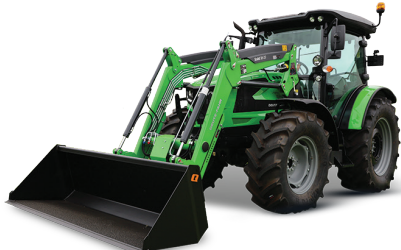
AGROFARM 5105 GS - LOADER READY

FREE STOLL 38-20 LOADER & 2.1 GP GP BUCKET VALUED AT $7,970