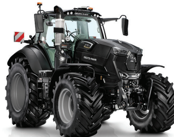
8280 TTV & FRONT LINKAGE PTO