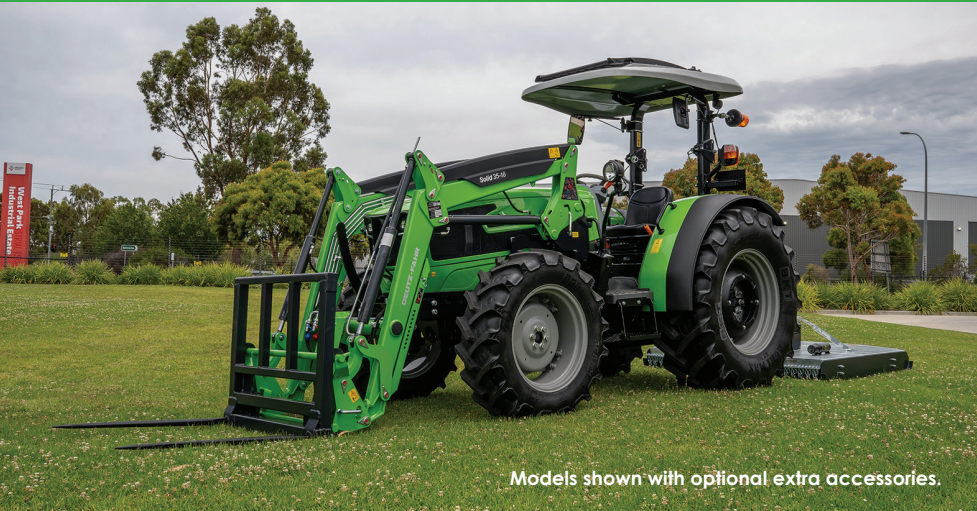
Models shown with optional extra accessories.