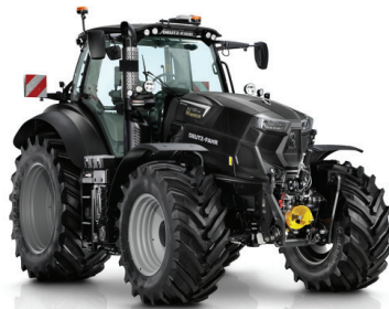
6230 RCFRONT LINKAGE PTO