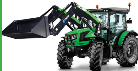
AGROFARM 5115 GS - LOADER READY

FREE STOLL 38-20 LOADER & 2.1 GP GP BUCKET VALUED AT $7,970