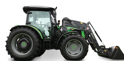
AGROFARM 5125 GS - LOADER READY

FREE STOLL 38-20 LOADER & 2.1 GP GP BUCKET VALUED AT $7,970