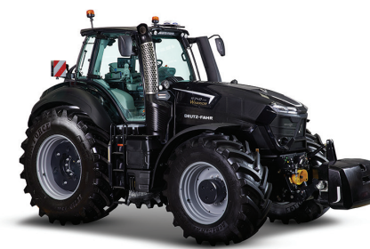
9340 TTV & FRONT LINKAGE PTO