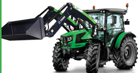
AGROFARM 5095 GS - LOADER READY

FREE STOLL 38-20 LOADER & 2.1 GP GP BUCKET VALUED AT $7,970